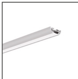
TOST A05393 Ref. arch B5393