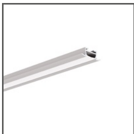
TAKO A05392 Ref. arch B5392