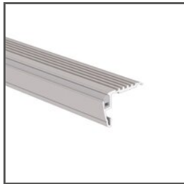
STEKO-PLUS Extrusion A06888