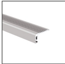
STEKO Extrusion A18018