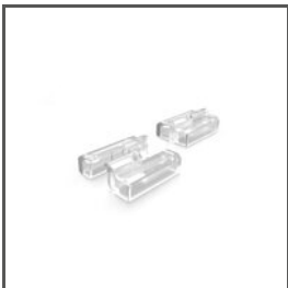
ADAPTERS SET ZM-16 C29001C00