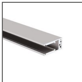
KRAV-810 Extrusion A18016AZM