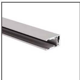
KRAV-05IN Extrusion A18045