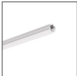
PIKO-O Extrusion A01167