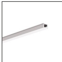
PIKO Extrusion A08288