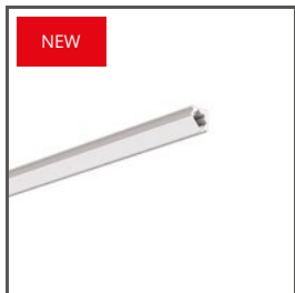
PIKO-45 Extrusion A00014