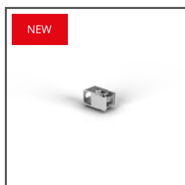
MOUNTING BRACKET HR-OPTI-45 C28091N00