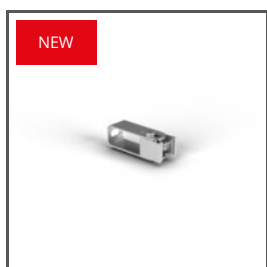
MOUNTING BRACKET HR-OPTI-75 C28092N00