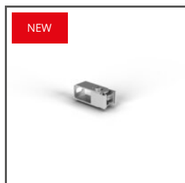
MOUNTING BRACKET HR-OPTI-60 C28090N00