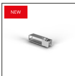
MOUNTING BRACKET HR-OPTI-90 C28093N00