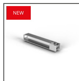
MOUNTING BRACKET HR-OPTI-155 C28095N00