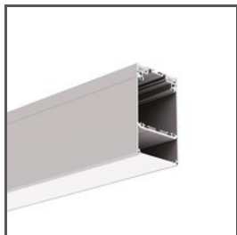
DES A18030 Ref. arch 18030