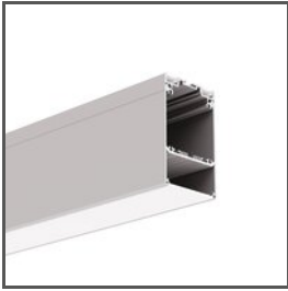
DES A18030 Ref. arch 18030